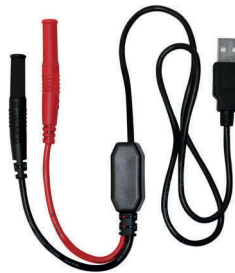
USB cable for charging